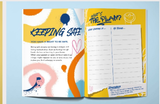
Young Person's Programme